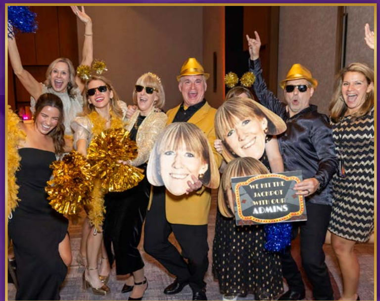
AVEO ONCOLOGY SPONSORED BY: TAKEDA PHARMACEUTICALS