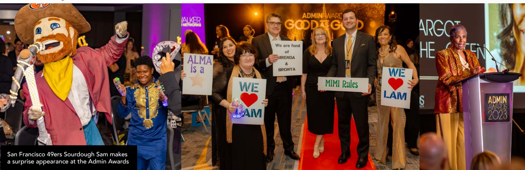
San Francisco 49ers Sourdough Sam makes a surprise appearance at the Admin Awards